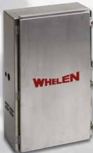
Type I Electronic Cabinet