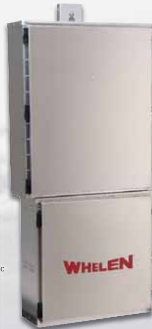
Type III Electronic Cabinet