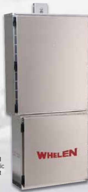
Type III Electronic Cabinet